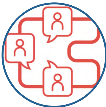
Regional Voice and Connectedness