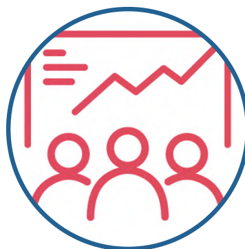
Regional Socio-Economic Practice