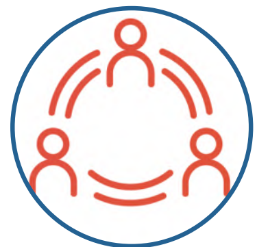
Community Governance and Management Capability