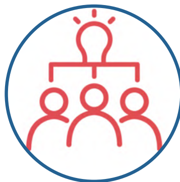
Community Leadership Skills